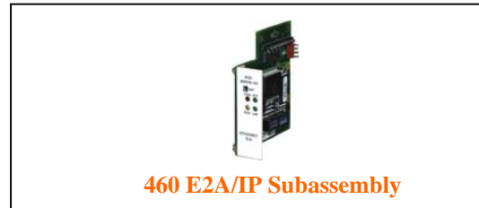
460 E2A/IP Subassembly

The E2A/IP design utilizes a combination of components, delivering a clean conversion process that have been extensively tested with the NMA ® platform by a major telecommunications laboratory. This solution does not affect the configuration at your Network Operations Center.